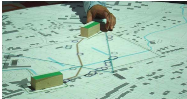
Figure 1: Creating a road by positioning two rectangles on the physical map

Roads are created in three steps: First, the users select one of the predefined types provided on small cards. Second, they assign this type to a colour by placing it on a dedicated colour region. Third, they create the road itself by positioning rectangular objects at both endpoints on the map. Between these two points, a cubic Bézier curve is projected, which can be controlled by rotating the rectangles. Each colour differentiates a different type of road (e.g., highway, normal road, cycle path, footpath, or railway). Both the top and the perspective view show a coloured stripe of variable width to visualize the respective road. The animated objects are visualized as moving dots on the table and as flip frame animations on the screen.